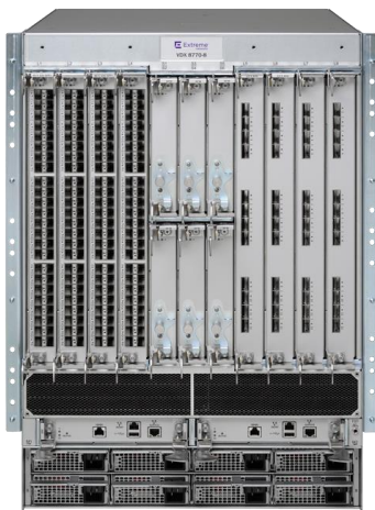
Figure2: The VDX 8770-8 Switch supports up to 384 10 GbE ports, 216 40 GbE ports, and 48 100 GbE ports.