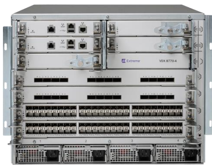
Figure1: The VDX 8770-4 Switch supports up to 192 10 GbE ports, 108 40 GbE ports, and 24 100 GbE ports.