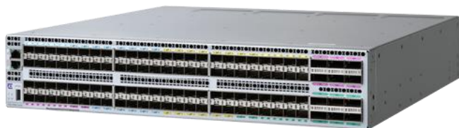
Figure2: The VDX 6940-144S Switch provides 96 1/10 GbE ports and 12 40 GbE or 4 100 GbE ports.

VDX 6940 switches provide the advanced feature set that data centers require while delivering the high performance and low latency virtualized environments demand. Together with Extreme data center fabrics, these switches transform data center networks by enabling cloud-based architectures that deliver new levels of scale, agility, and operational efficiency. These highly automated, software-driven, and programmable data center fabric design solutions support a breadth of network virtualization options and scale for data center environments ranging from tens to thousands of servers. Moreover, they make it easy for organizations to architect, automate, and integrate current and future data center technologies while they transition to a cloud model that addresses their needs, on their own timetable and on their terms.