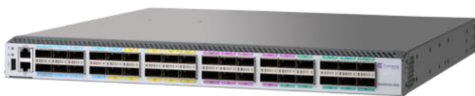
Figure1: The VDX 6940-36Q Switch provides 36 40 GbE ports.

In a leaf deployment, 10 GbE and 40 GbE ports can be mixed, offering flexible design options to cost-effectively support demanding data center and service provider environments. As in other VDX platforms, the VDX 6940-36Q offers a Ports on Demand (PoD) licensing model. VDX 6940-36Q is available with 24 ports or 36 ports. The 24-port model offers a lower entry point for organizations that want to start small and grow their networks over time. By installing a software license, organizations can upgrade their 24-port switch to the maximum 36-port switch.