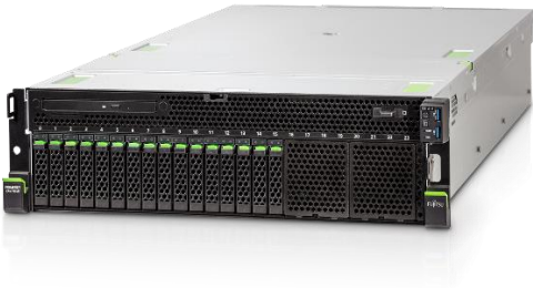
*2 CPU: Intel Xeon Gold 6418H Processor Assuming the server is operated at 30% of potential maximum utilization for 24 hours a day, 365 days a year, and for 4 years.