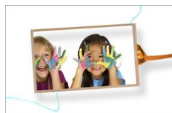
Multi-Input Touch Panels